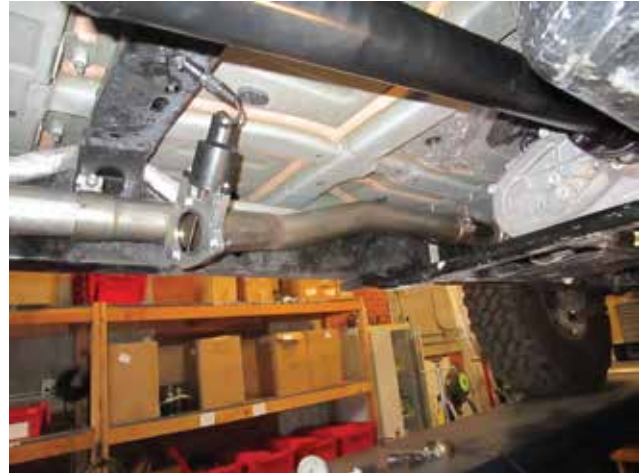
Image D: Install slipover first then the swivel seal end. orientate the valve as shown when installed.