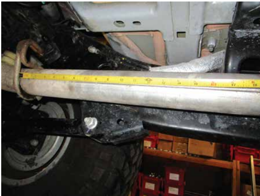
Image A: Measure from the hanger 17" towards the front of the vehicle, mark and cut the factory exhaust there.