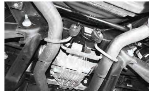
Use seam between diff cover and diff housing as cut line

Step 3: Carefully remove each muffler by removing the hangers from the rubber isolators. Once removed deburr the cut end of the remaining factory exhaust with a file. It is critical to remove all burrs as they may keep the new pipes from slipping over the factory exhaust.