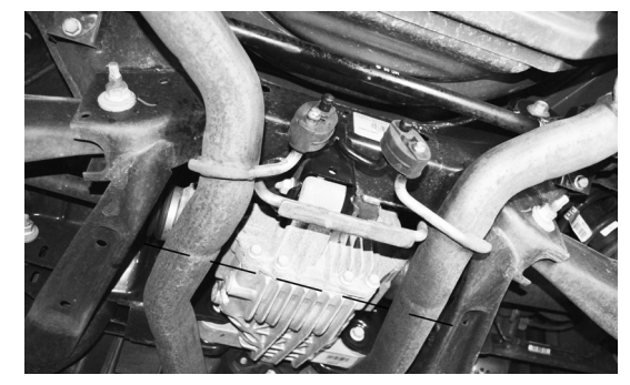
Use seam between diff cover and diff housing as a cut line Figure 1