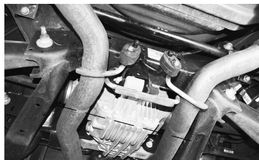
Use seam between diff cover and diff housing as a cut line Figure 1